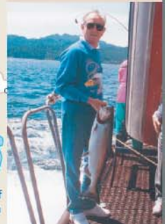
Fishing off the stern

MYSTERY CRUISE Anywhere within the Red and Purple boundaries.